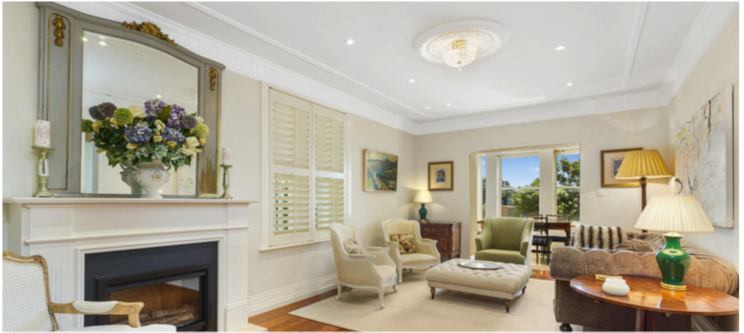
Unit 2, 7 Longworth Ave, Point Piper