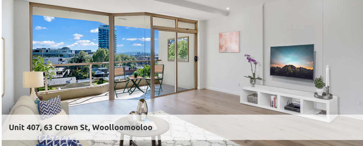
Unit 407, 63 Crown St, Woolloomooloo